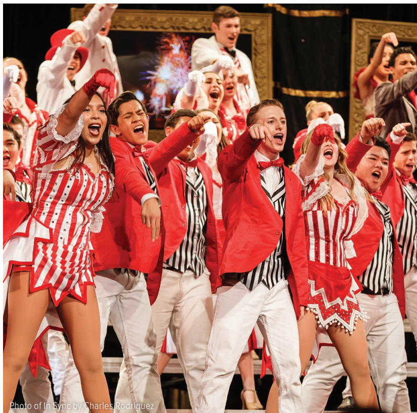
Photo of In Sync

a few weeks we had a draft of a piano/vocal score to 'Get Away, Joe!' I printed it out and had my girls sing through it that afternoon. They loved it and we knew it would be a hit."